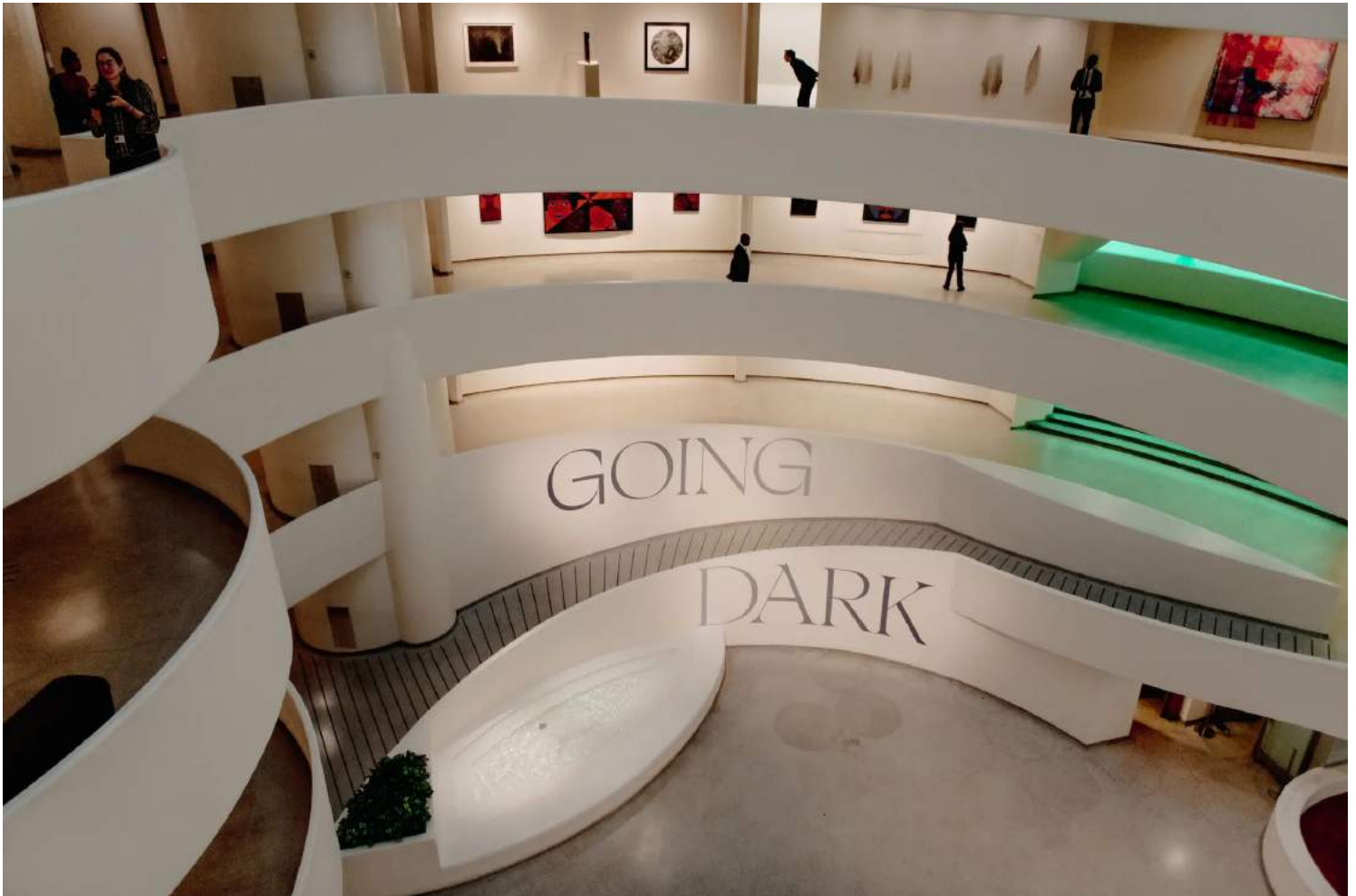
Installation view of “Going Dark” at the Guggenheim, featuring the work of 28 artists who explore the question of what it means, especially for people of color, to be subject to increased surveillance yet at the same time erased from the field of vision, forgotten in the social landscape.

Watch this installation, by the artist Sandra Mujinga, long enough, and when you turn toward the rotunda, something remarkable happens: The stark-white museum turns entirely pink. (The effect subsides as your eyes readjust.)