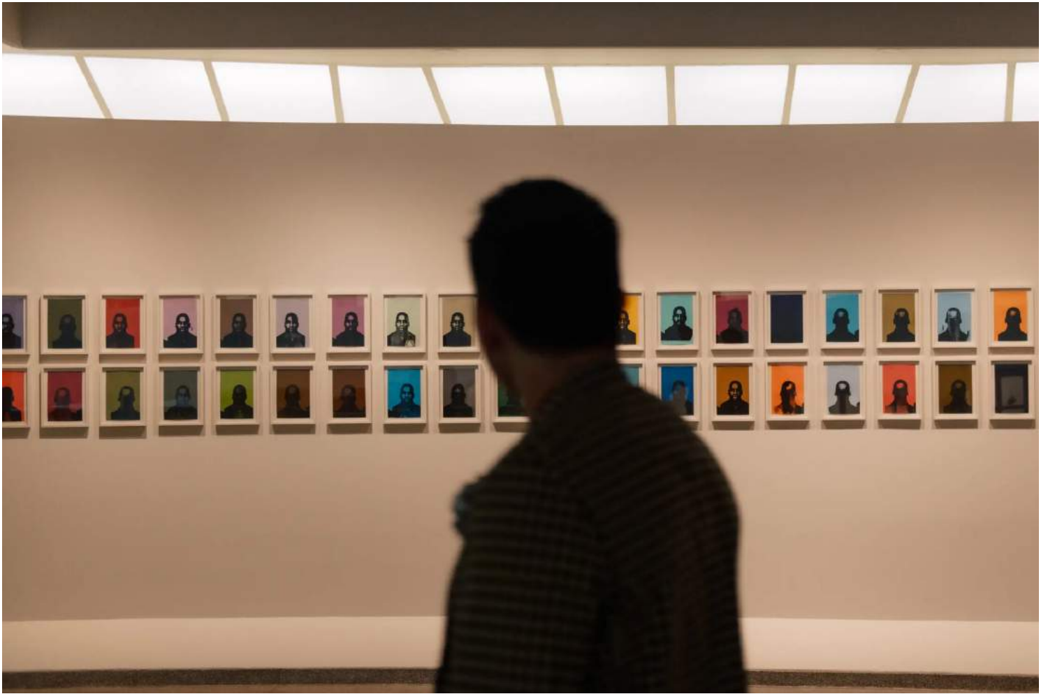
Glenn Ligon's "Figure" (2001), 50 self-portrait photos silk-screened on brightly colored paper veer in and out of legibility.