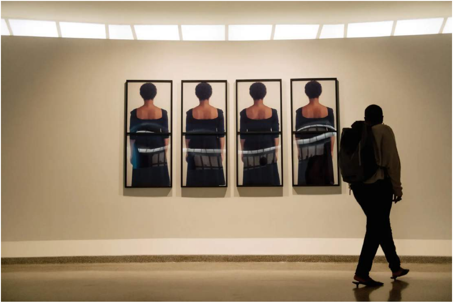
Lorna Simpson's work from the late 1980s and 1990s, such as "Time Piece" (1990), laid the groundwork for much of the conceptual approach in "Going Dark."