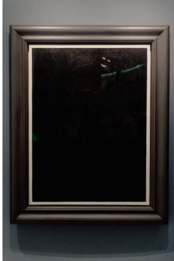
In Kerry James Marshall's "Invisible Man" (1986), inspired by Ralph Ellison's 1952 novel, the painter equates invisibility with black paint.

One of the key artworks in the show is Kerry James Marshall's painting "Invisible Man" (1986), inspired by Ralph Ellison's 1952 novel. In that book, the nameless main character lives in a state of social obscurity — "I am invisible, understand, simply because people refuse to see me." Marshall translated that idea into paint — a faint outline of a naked man barely emerges out of the inky background. It is almost, but not quite, a monochrome. The picture is difficult to make out, but also uncomfortable to look at — the stark white eyes and teeth of the figure, along with his naked pose, veer dangerously close to old, cruel stereotypes.