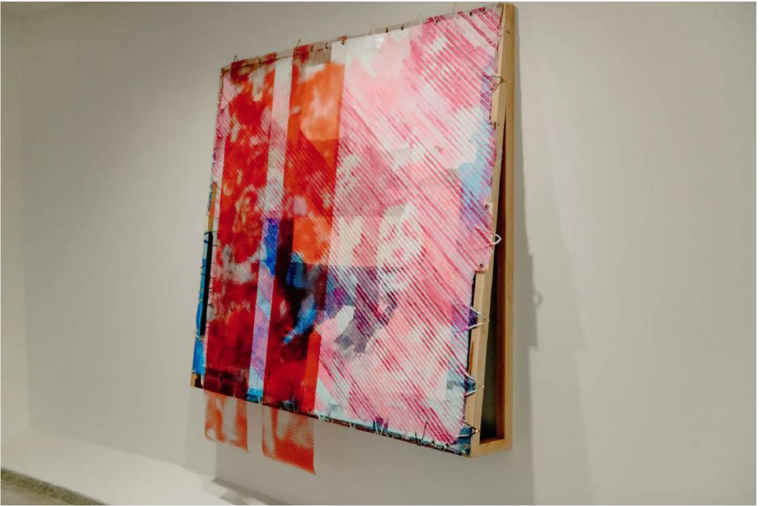
Tomashi Jackson's "Day Glow (Backlash)," from 2022, consists of historical photos from the civil rights movement printed on layers of vinyl; as the viewer moves in front of it, the image becomes more or less readable.

A number of objects in the show grapple with photography's role in classifying, colonizing, and criminalizing people of color. Much of this work shares a lineage with Lorna Simpson's art from the 1980s and '90s. In "Time Piece" (1990), Simpson captures four near-identical images of a woman that have the feel of a medical textbook or anthropological study. She is shown only from the back, however, allowing her to evade the viewer's gaze — and thus any attempt to categorize her.