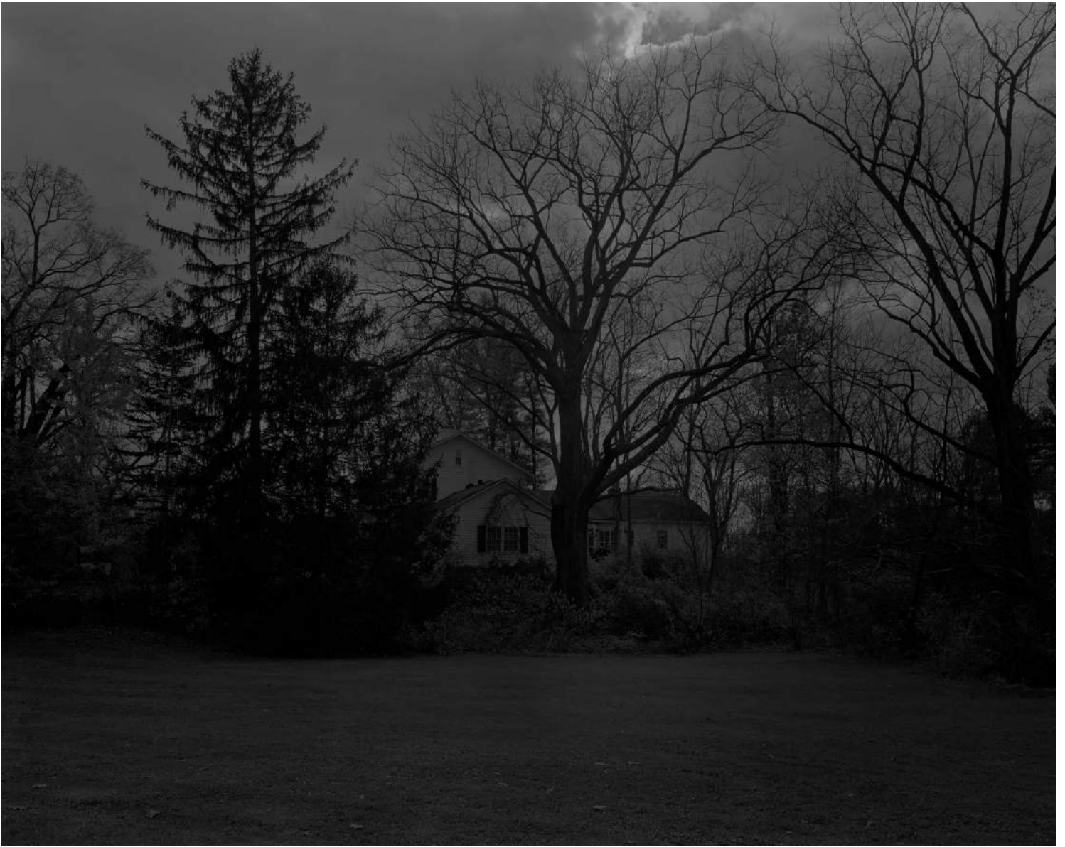
Dawoud Bey photographed sites that may have been routes for the enslaved seeking freedom in his 2017 series "Night Coming Tenderly, Black," including this image, "Untitled #14 (Site of John Brown's Tannery)."